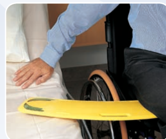
Samarit Nursing Aids

Download your language from our website or ask your local distributor.